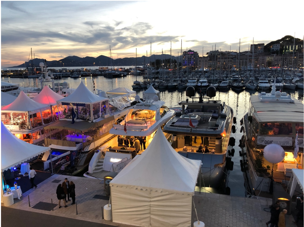
Cannes, the Old Port, during international property fair MIPIM, March 2019

14/20 Boulevard Newton, 77447 Marne-la-Vallée cédex 2